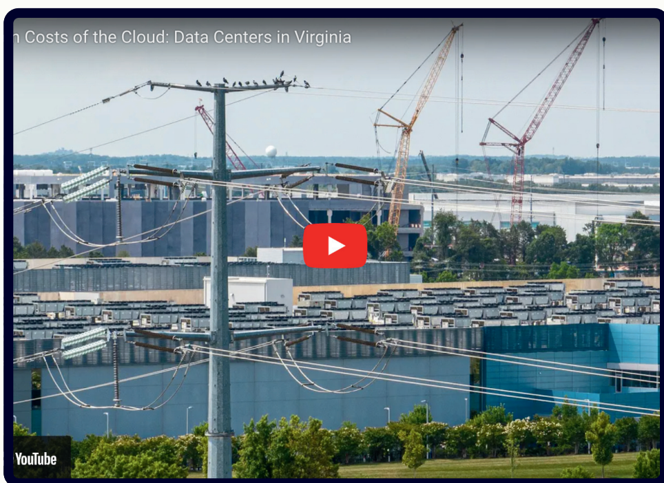
“Hidden Costs of the Cloud: Data Centers in Virginia” video

Find everything you need to get engaged at pecva.org/datacenters .